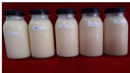
Fig.1. Yoghurt with tamarillo juice addition research results

According to Astawan (2008) [11], anthocyanins found in tamarillo are a group of reddish-colored dyes that are soluble in water and can be used as food and beverage dyes. In addition, the color of tamarillo yoghurt is also determined by the raw milk used. According to [12], milk has a white to yellowish color, depending on the type of animal, feed, fat content, and solids contained in milk.