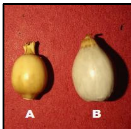
Figure 1. Seed display of two job's tears cultivars: (A) Pulut cultivar, (B) Batu cultivar.

This research was conducted on community land located in Kuranji District, Padang City, West Sumatra from July to December 2021. The job's tears cultivars used in the study were Pulut and Batu (seeds sourced from private collections), while the NPK fertilizer used was NPK Mutiara (16:16:16). This research was a two-factor factorial experiment with 3 replications arranged in the form of a Randomized Group Design (RAK). The first factor was the use of cultivars, namely Pulut and Batu cultivars. The second factor is the application of NPK fertilizer with different doses, namely: 0 kg/ha, 100 kg/ha, 200 kg/ha, and 300 kg/ha. job's tears was planted in polybags, each plot for each treatment consisted of 10 polybag plants, 5 polybags were used as sample plants. Observation data were analyzed statistically to determine the influential treatment using the F test at the 5% level and significantly different data will be subjected to further testing using the DNMRT test at the 5% level. Observations were made on plant height, stem diameter, leaf length and width, number of seeds per plant, seed weight per plant and 100 seed weight.